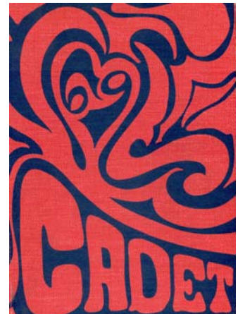
Class of 1969 Cadets

We are interested in reading about your adventures!